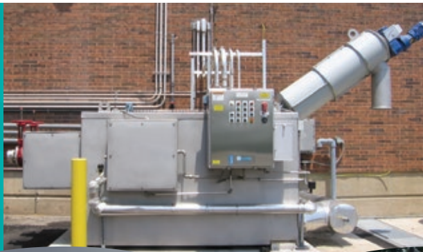
Weather Protection Package

The septage hauler receives a printout of the load details, including date, time, hauler name, waste type, total gallons uploaded, elapsed time for unloading and any faults incurred, if applicable.