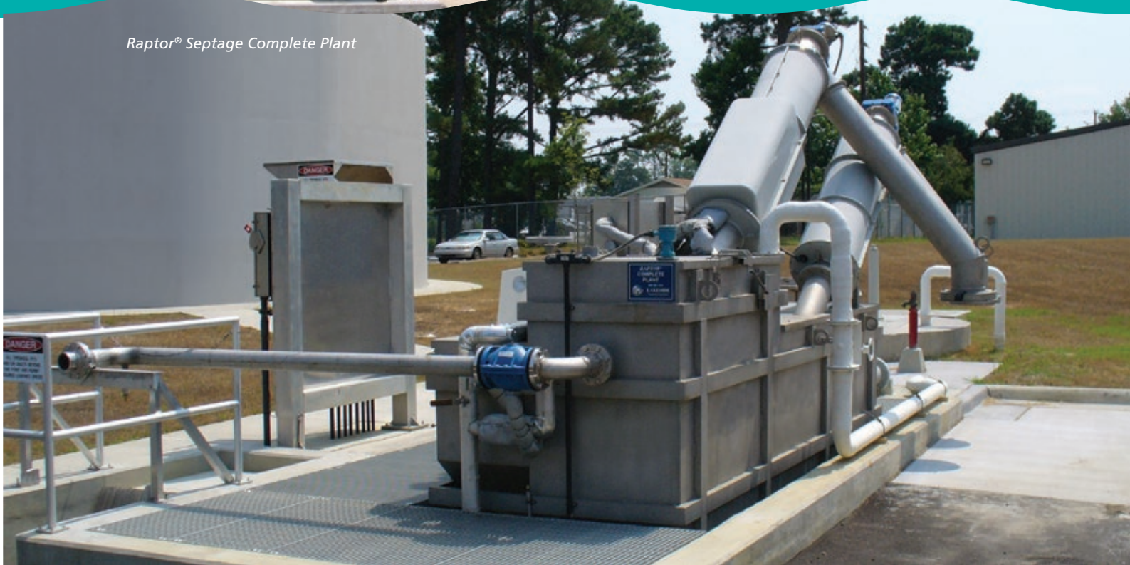
Raptor® Septage Complete Plant