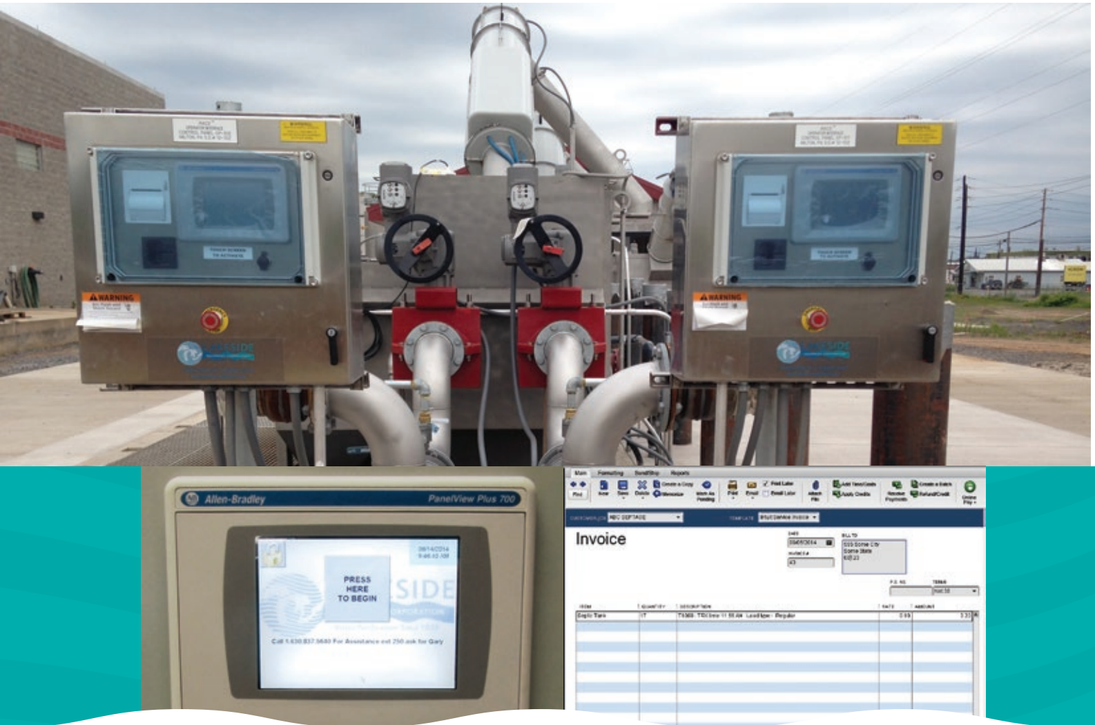
RACS Station for Security Access