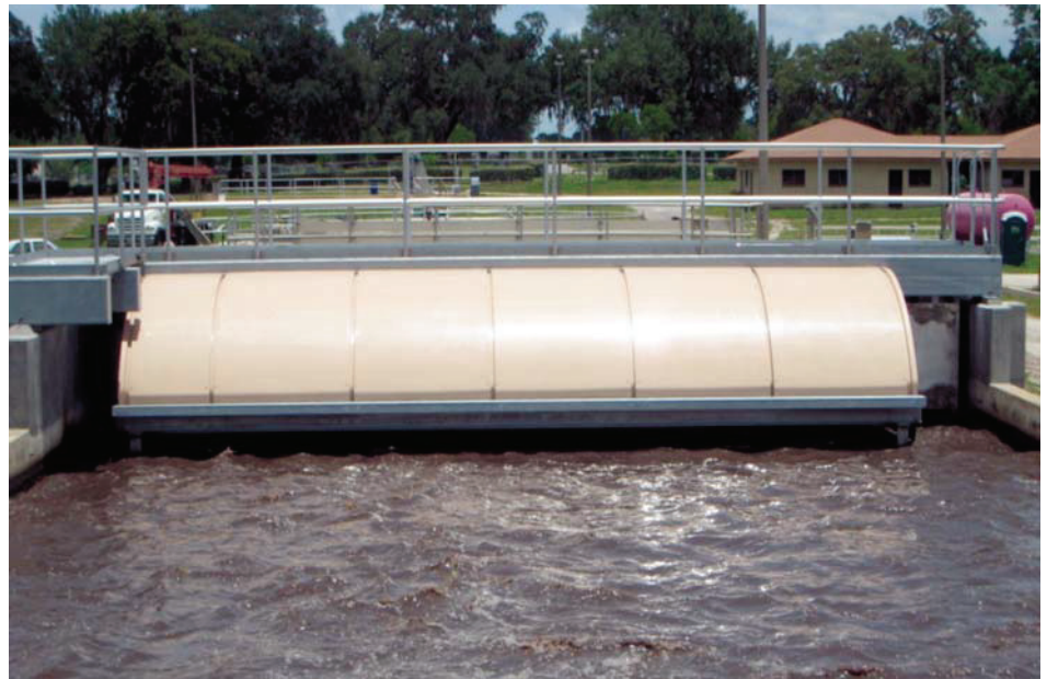
Lakeside's rotor as seen from the bridge of an operating rotor upstream in the channel.

The operational concept of the BNR system was to continuously monitor DO levels and adjust the rotor speed to maintain a preset DO concentration. This concept included flex-